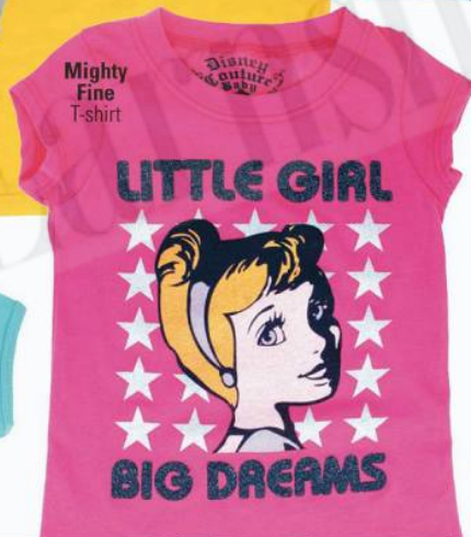
Mighty Fine T-shirt