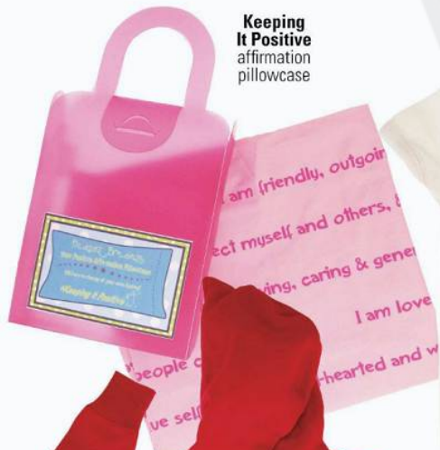
Keeping It Positive affirmation pillowcase