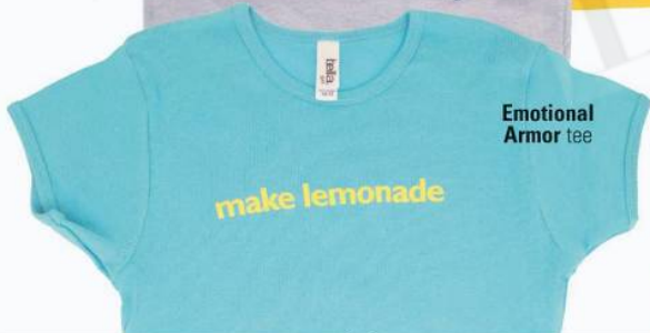
Emotional Armor tee