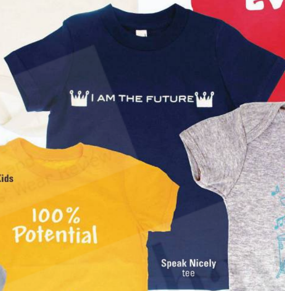
Cultivate Kids T-shirt