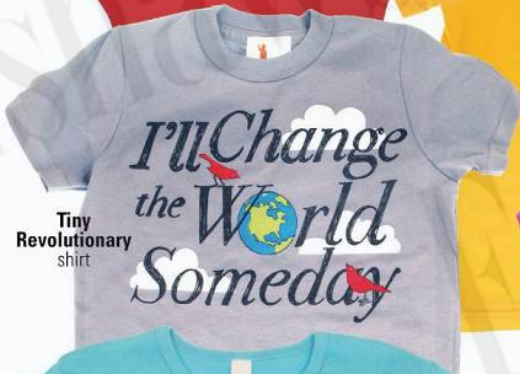
Tiny Revolutionary shirt