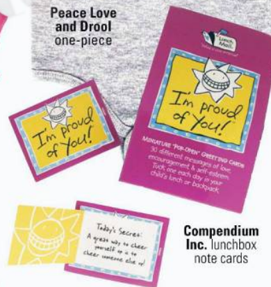
Compendium Inc. lunchbox note cards