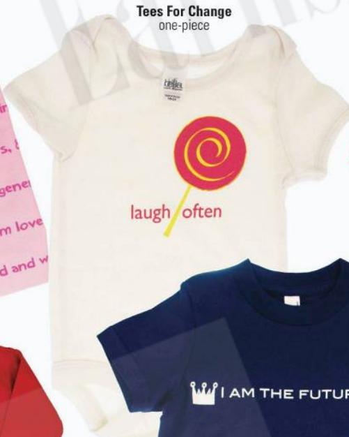
Tees For Change one-piece