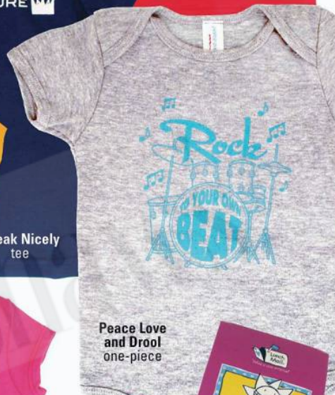
Peace Love and Drool one-piece