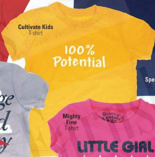
Speak Nicely tee